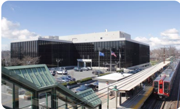
GREENWICH PLAZA GREENWICH, CT – 354,000 SQ. FT.