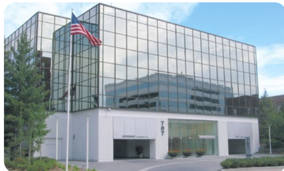
707 SUMMER STREET STAMFORD, CT – 74,000 SQ. FT.