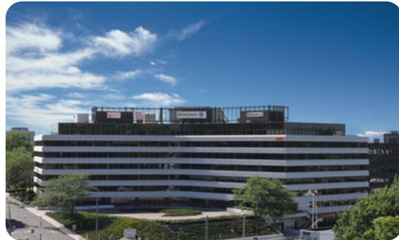
3001 STAMFORD SQUARE STAMFORD, CT – 290,000 SQ. FT.