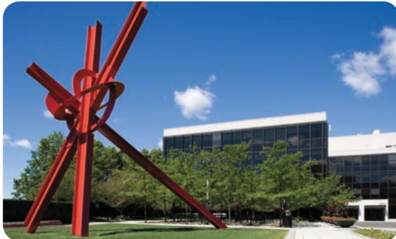
GREENWICH PLAZA GREENWICH, CT - 354,000 SQ. FT.