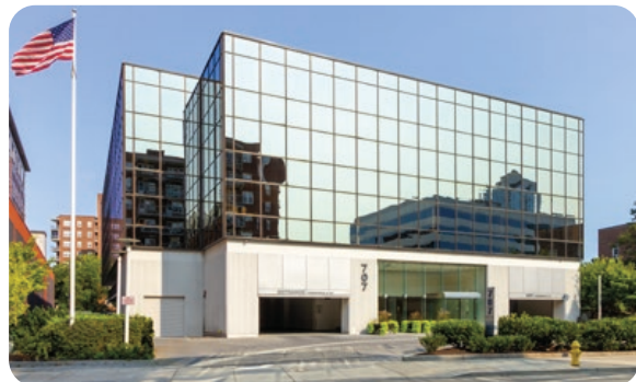
707 SUMMER STREET STAMFORD, CT - 74,000 SQ. FT.