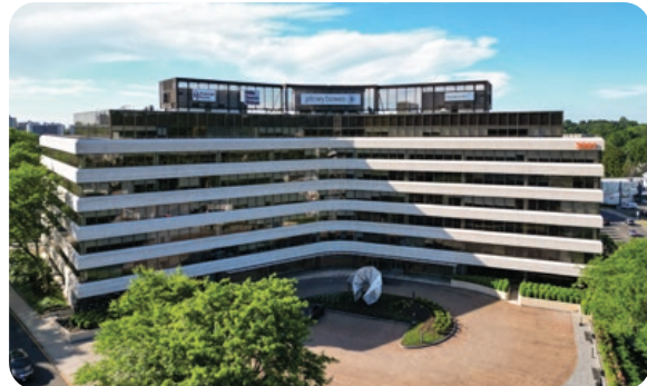
3001 STAMFORD SQUARE STAMFORD, CT - 290,000 SQ. FT.